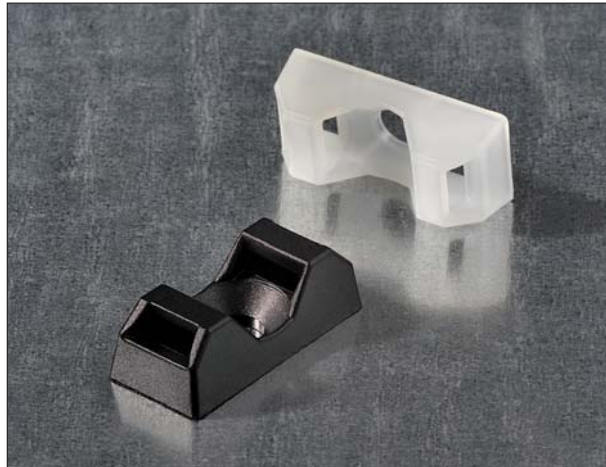
Q-mount, CTQM 2-way entry, screwable.

The Q-mount offers a perfect solution in combination with the Q-tie cable ties. It keeps the inserted cable tie in place during pre-assembly and ensures that the Q-tie does not slip out even in difficult situations, for example vertical mounting positions.