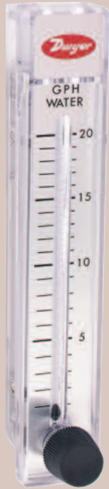
Model RMB-SSV 5" scale, 8-3/4" high