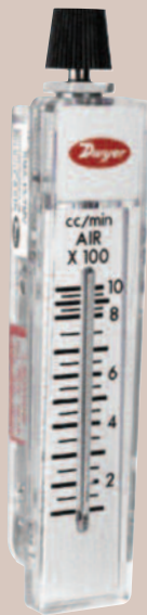
Model RMA-TMV 2" scale, 4-13/16" high