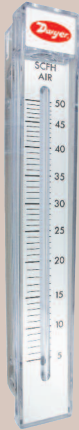
Model RMC 10" scale, 15-3/8" high

Polycarbonate, Gas Flow from 0.05-1800 SCFH, Water Flows to 10 GPM