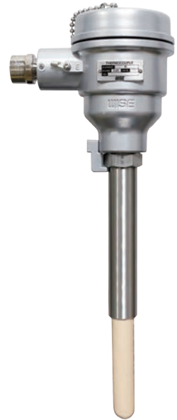
Non-metallic protection tube type